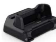
CH20L19 Desktop Charger