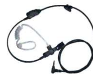
EAS07 Transparent Tube Earpiece with in-line PTT