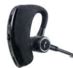
EHW08 Bluetooth Earpiece with PTT Button and Mic