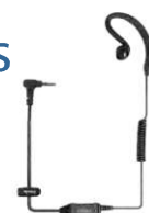
EHS30 Earpiece with in-line PTT & C-Earset