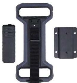
POA207 Protective Case with Hand Strap BRK37 Protective Case with Mounting Bracket BC39 Belt clip for use with POA207